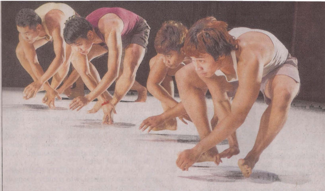
KHMEROPEDIES III: Source/Primate attempts to tease out the notion of humanity through monkey behaviour.