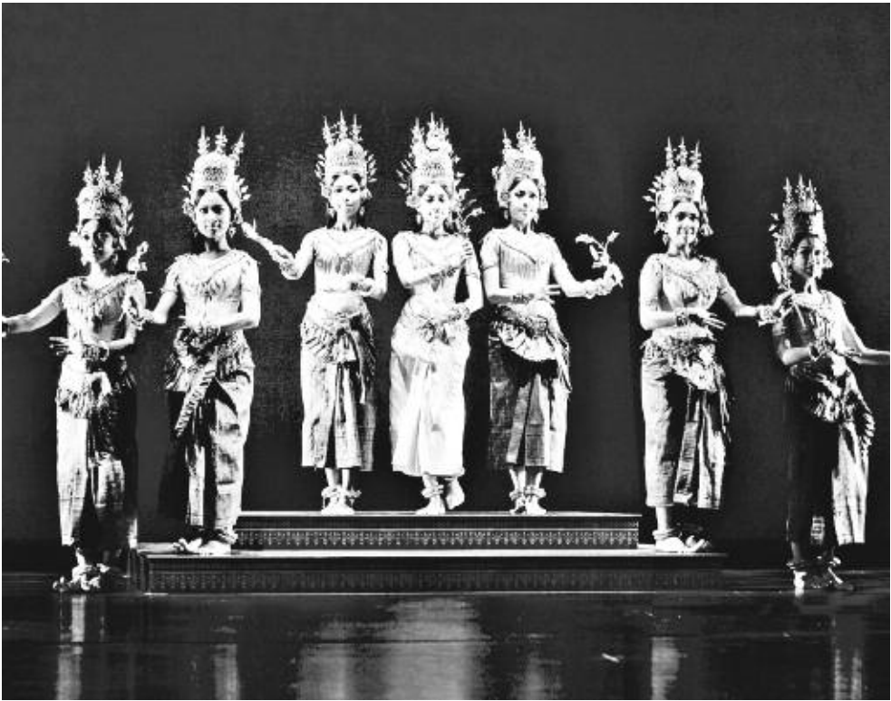
The Legend of Apsara Mera.

dlelit altar located downstage right. Two female elder dance masters entered along with the chorus, musicians, and the four principal dancers to perform the Sampeah Kru ceremony. They knelt before the altar, praying to the spirits of the artists and teachers who came before and requesting protection and inspiration during the performance. The two masters then took the headdresses for each of the four roles from the altar and ceremonially placed them on the heads of the assigned performers – giving them license to inhabit the roles. And so began the performance.