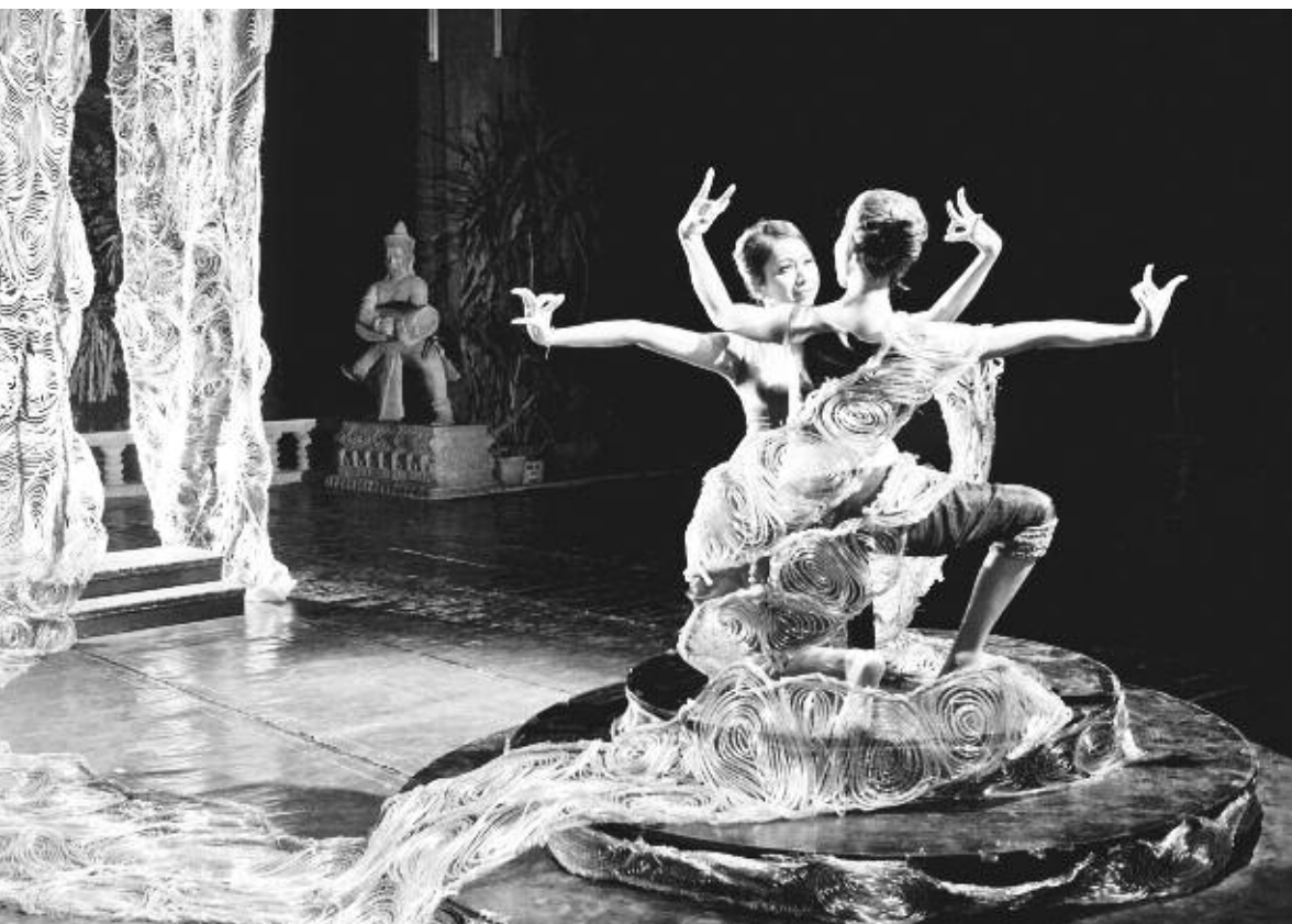
Khmer Arts Ensemble in Sophiline Cheam Shapiro's A Bend in the River .

the dancing body . . . reflects the curvilinear form of the serpent." The dancers often trace a figure-eight floor pattern "recreating and honoring the image and spirit of the naga ," or sacred serpent, which represents the spirit and immortality of Cambodia through its control of rain and fertility. The naga , so prominent in Cambodian myth, is also illustrated in temple carvings and architecture.