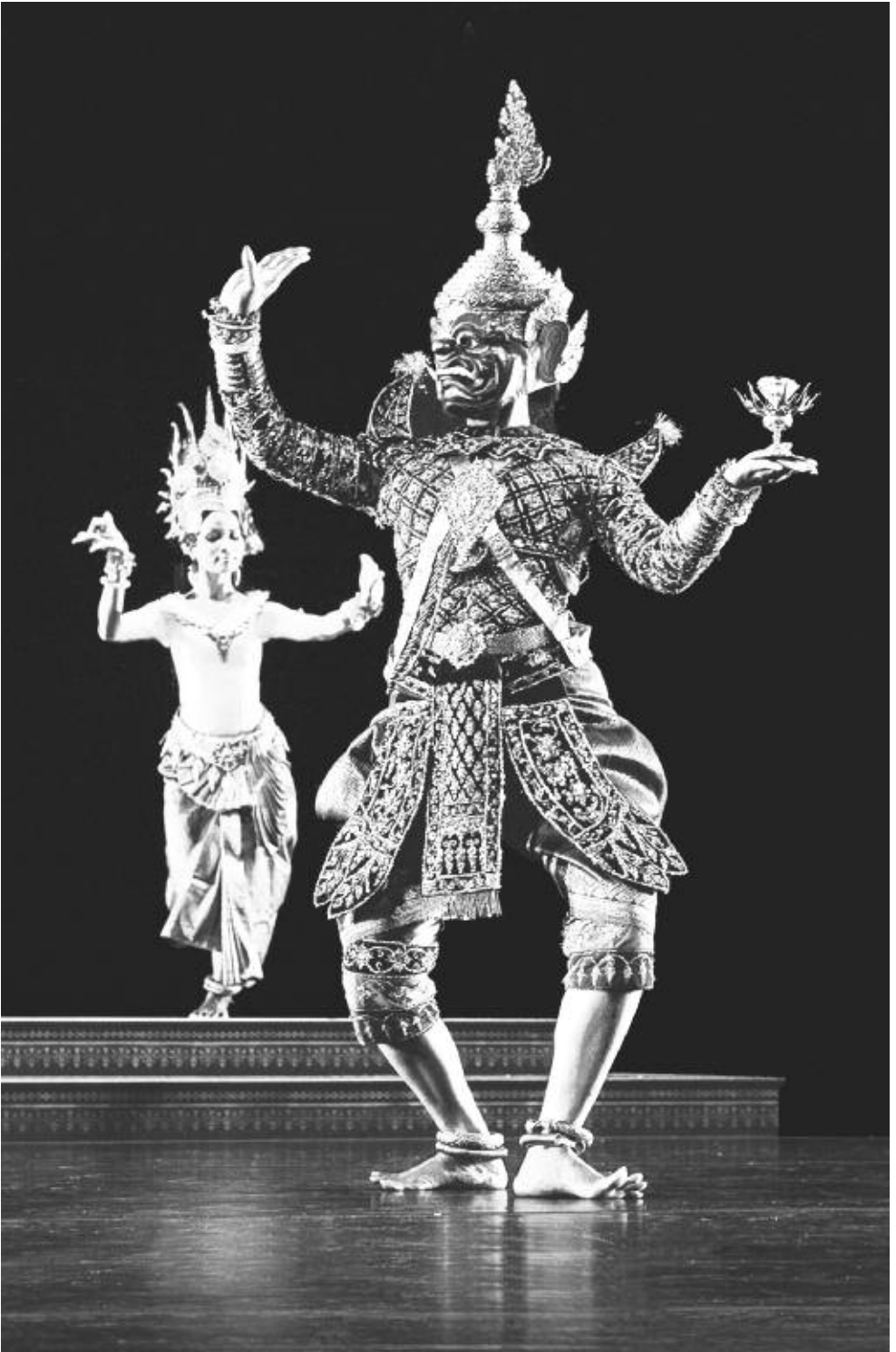
The Legend of Apsara Mera. (Photo: Pete Pin, Royal Ballet of Cambodia, BAM)